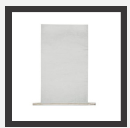
Multiwall White Paper Bag