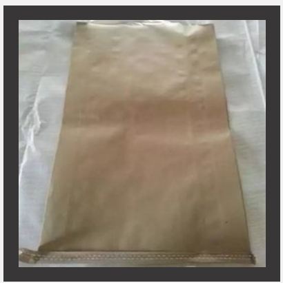
HDPE Laminated Paper Bag