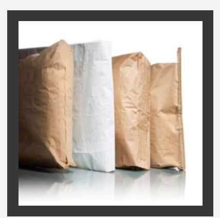
Multiwall Paper Bag