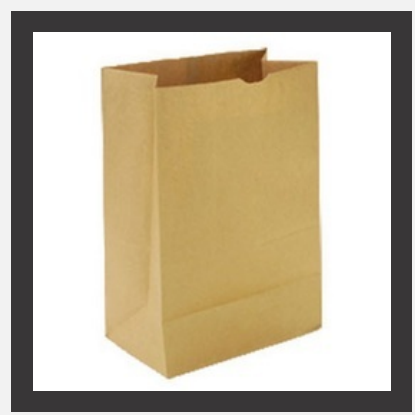
Brown Paper Bag