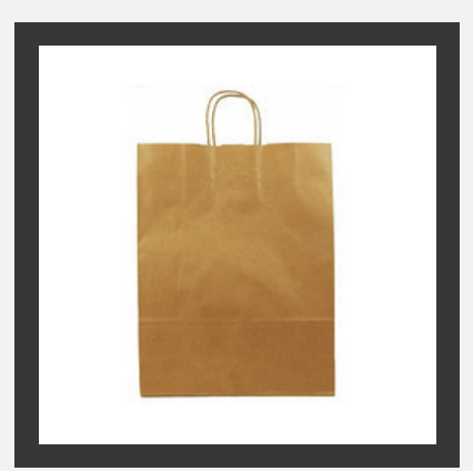
Plain Paper Bag