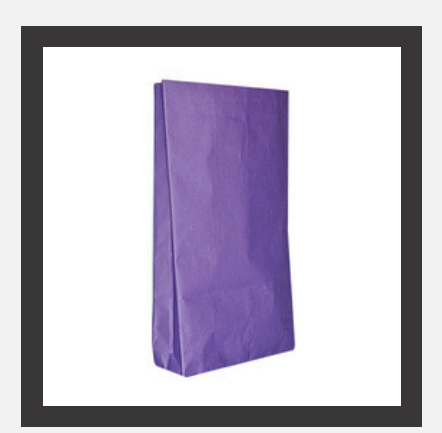
Plain Multiwall Paper Bag