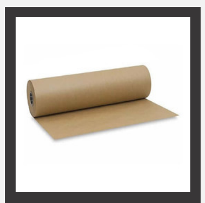
HDPE Laminated Paper Roll