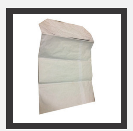
Plain Valve Paper Bag