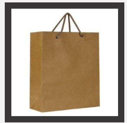
Shopping Paper Bag