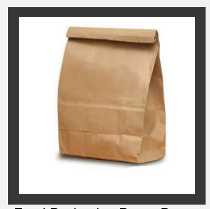
Food Packaging Paper Bag