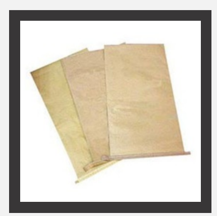
HDPE Laminated Centre Sealed Brown Paper Bag