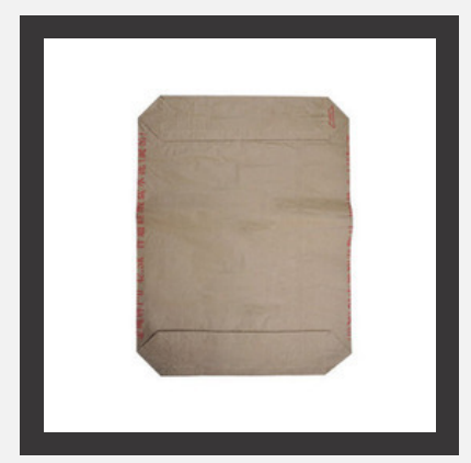
Valve Type Paper Bag