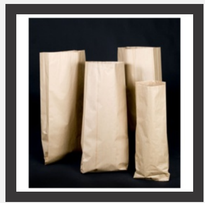
Multiwall Paper Bags