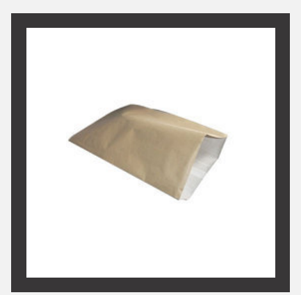
HDPE Laminated Kraft Paper Bag