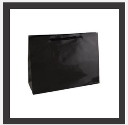
Laminated Paper Bags