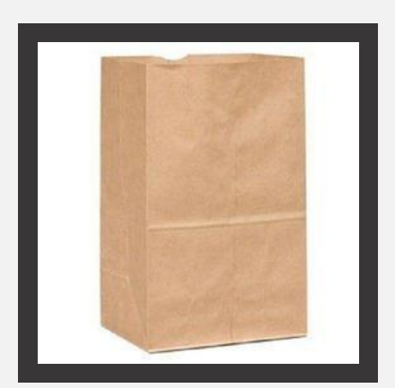
Brown Grocery Paper Bag