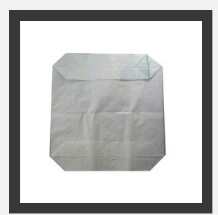
Pasted Valve Bag